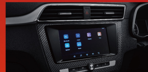
Three Steering Modes

The engine's maximum power output is 84kW, with a peak torque of 150N m, providing ample power. With a dependable transmission, the combination ensures reliability and durability.