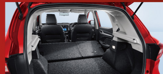
Large-sized flat boot

Comfortable ergonomic high seats with a wider field of vision for a more reassuring drive.