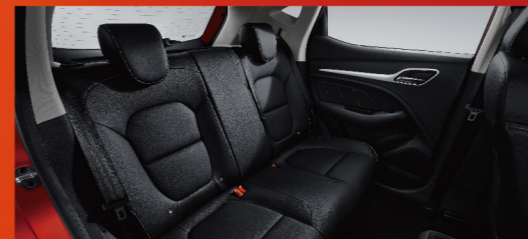
Spacious rear seating area.

Adjustable large-sized boot supports completely flat rear seat folding, offering ample loading capacity.