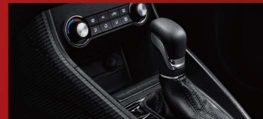
20+ storage spaces

Rear legroom extends up to 850mm, allowing for comfortable leg extension without feeling cramped.