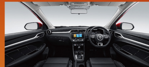
Convenient and cosy home

The athletic side profile conveys a poised and dynamic posture, ready to meet your travel needs anytime and anywhere.