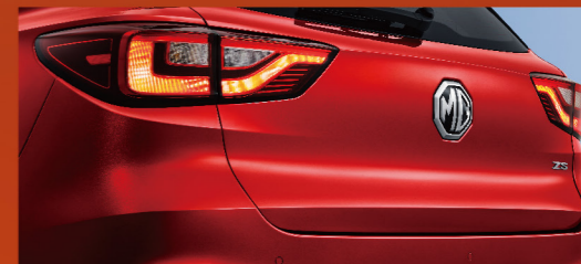
Rugged rear design

The London Eye Headlamp reflected in the Thames River, interplay with the radiant grille, shimmering and extraordinary. Classic British design elements create the understated, dynamic and highly recognizable ZS.