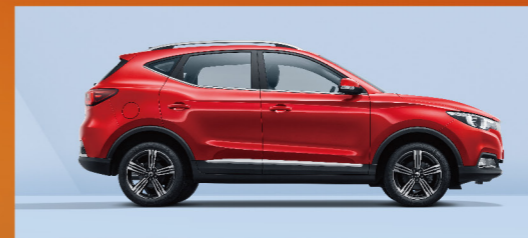
Dynamic side styling

The rear stance is solid and stable, with the taillights and tailgate switch design showcasing its personality.