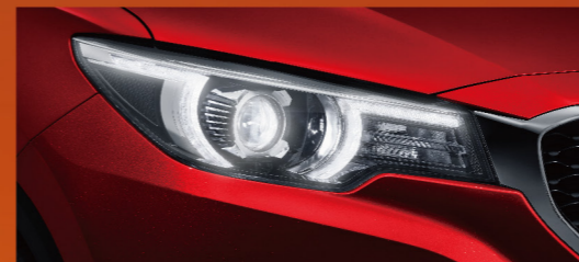
London Eye Shines in the Starry Sky

Inspired by British design, classic and timeless, the cabin offers a comfortable and practical experience that feels like home.